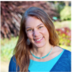
Dashka Slater | Author, "The Wishing Box," "Escargot," "The 57 Bus"