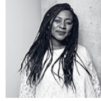
Alicia Garza (via Skype) | Founder, Black Futures Lab; Co-Founder, Black Lives Matter